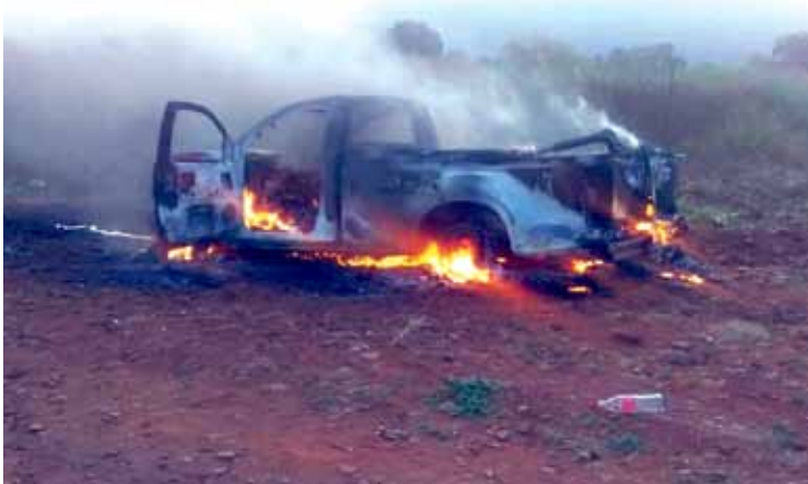
The vehicle that was used by the suspected stock thieves up in flames after being torched by angry community members in Mafefe.