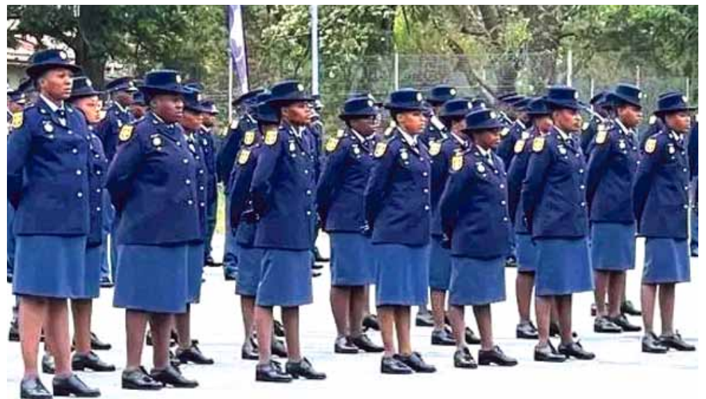
The newly trained constables will be deployed in various police station to fight against crime across the country.