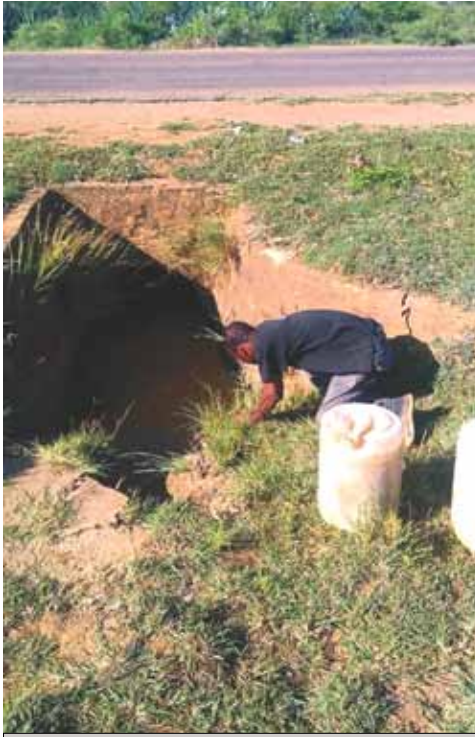
Residents in Moutse still rely on nearest rivers and wells to draw drinking water despite of over R120 Million spent on incomplete water projects.

Those who don't have money to buy water are forced to rely on the nearby rivers and wells.