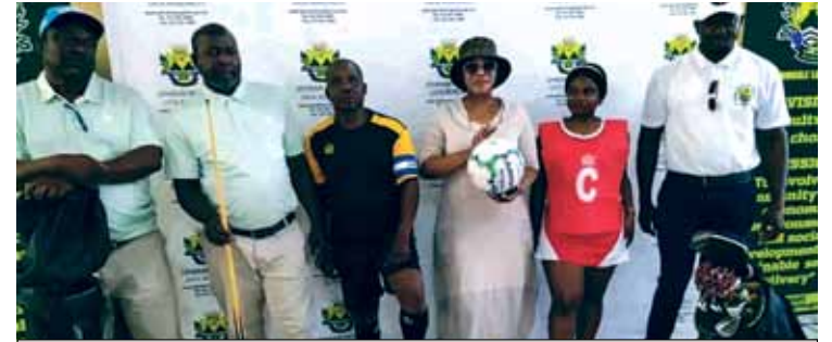
The Ephraim Mogale Local Municipality team that is currently participating in the IMSSA Games in Polokwane.