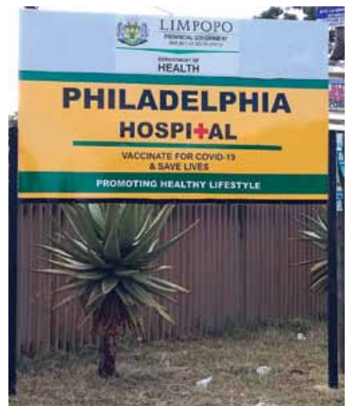
Philadelphia Hospital in Dennilton cannot perform operations as a result of non-supply of Betadine solution for the past two weeks and broken machines.